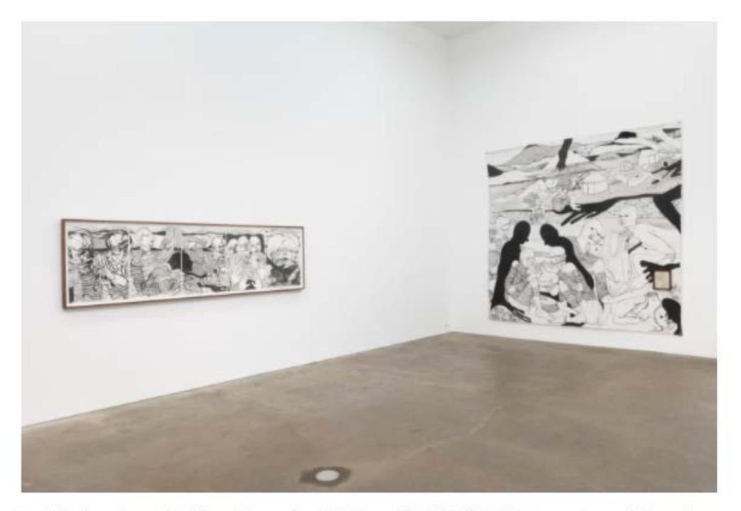
Installation view of William Downs' exhibition at Derek Eller.

Don't miss William Downs at Derek Eller. The Georgia artists' large ink drawings pull off some spatial image-object trickery that is able to generate sculptural form through density and line; accomplishing an inky plasticity via graphic illusion. The approach in Downs' work is anti-individual, but the collectivist crowd actions depicted might not be towards any kind of sense making or harmony.