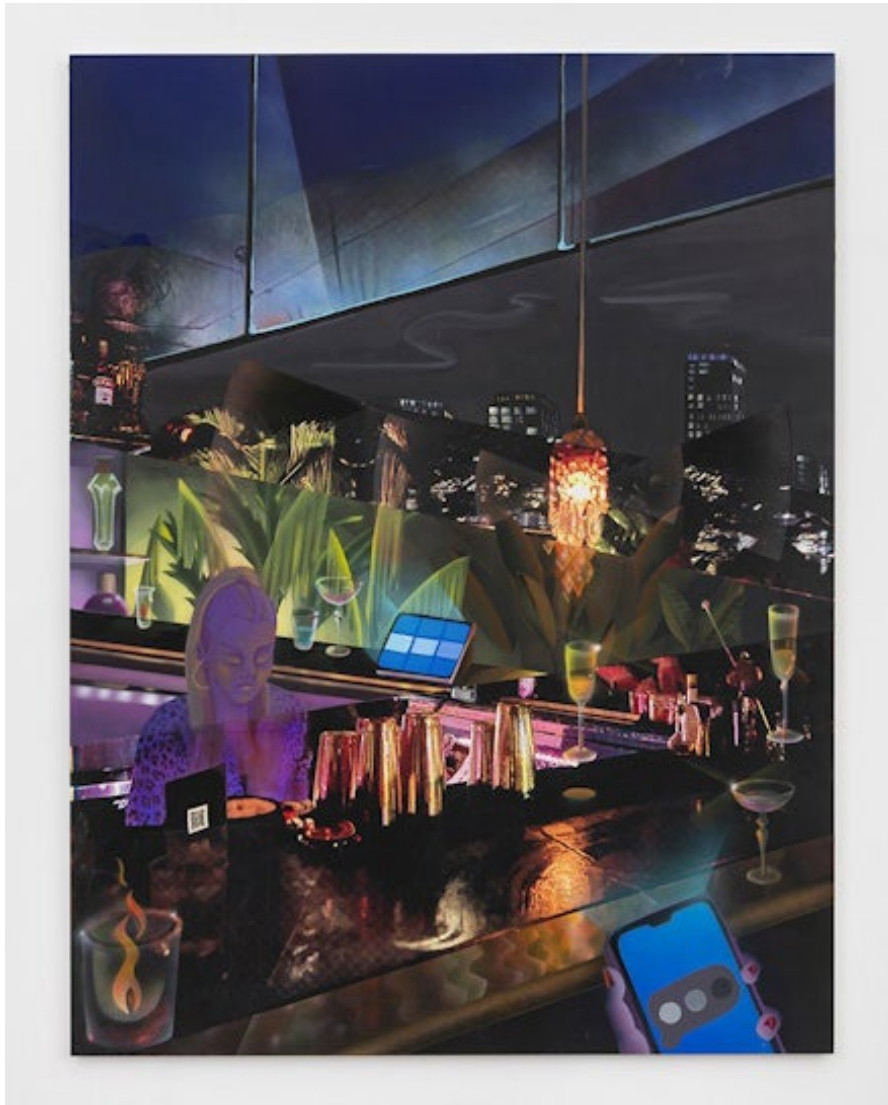
Melissa Brown, Where R U? , 2023. Flashe, oil, acrylic on Dibond, 72 x 55 inches.

The painting titled Where R U? (2023) is set inside a bar the artist frequents. The viewer's vantage point is the same as the painting's protagonist. This is accented by the painted hand holding a mobile phone in the bottom corner of the painting. The viewer looks over the bar and gazes at the bartender, focused on their occupation. The painting's subject is reminiscent of Edward Hopper's New York City view in Nighthawks (1942) and Édouard Manet's A Bar at the Folies-Bergère (1882). The mixture of CMYK printing, flashe, acrylic, airbrush, and oil paints offers a dazzling combination of skillfulness that coalesces in an intoxicating perceptual view.